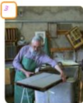
3 After that, the pulp is dried and made flat.

11 How is paper manufactured? Order the sentences and write.