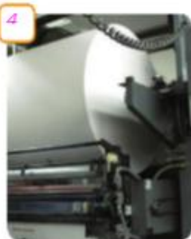
4 Finally, the paper is made into sheets.