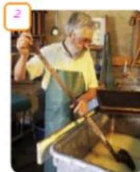
2 Next, it is mixed with special products and made into pulp.